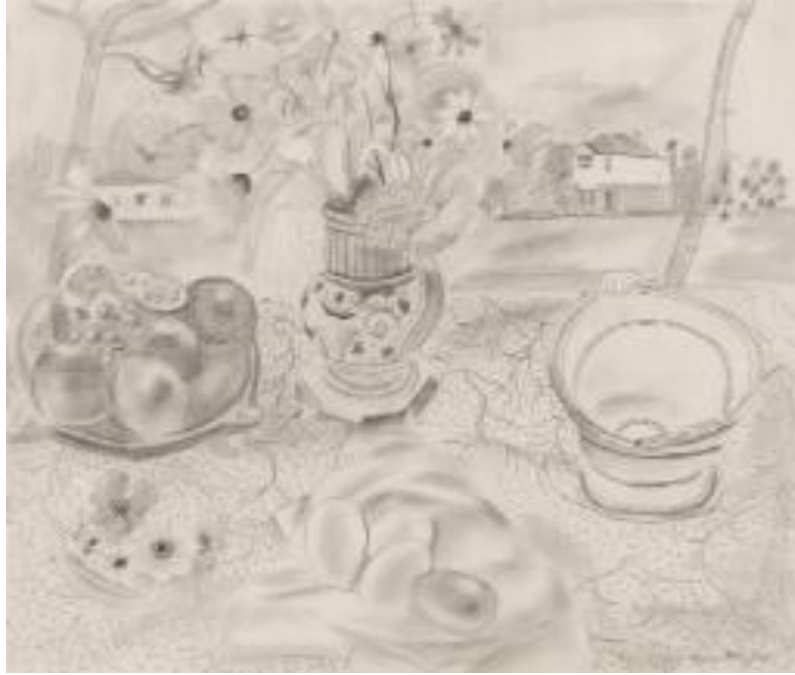
Frances Hodgkins Still Life 1929

Frances Mary Hodgkins (28 April 1869 – 13 May 1947) was a New Zealand painter chiefly of landscape and still life, and for a short period was a designer of textiles. She was born and raised in New Zealand, but spent most of her working life in England. She is considered one of New Zealand's most prestigious and influential painters, although it is the work from her life in Europe, rather than her home country, on which her reputation rests.