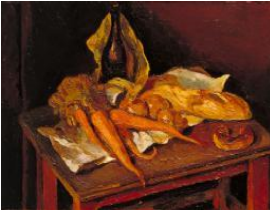
Duncan Grant- Still Life with Carrots 1921